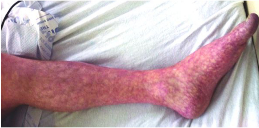
Fig. 6. Livedo reticularis of the lower extremity.