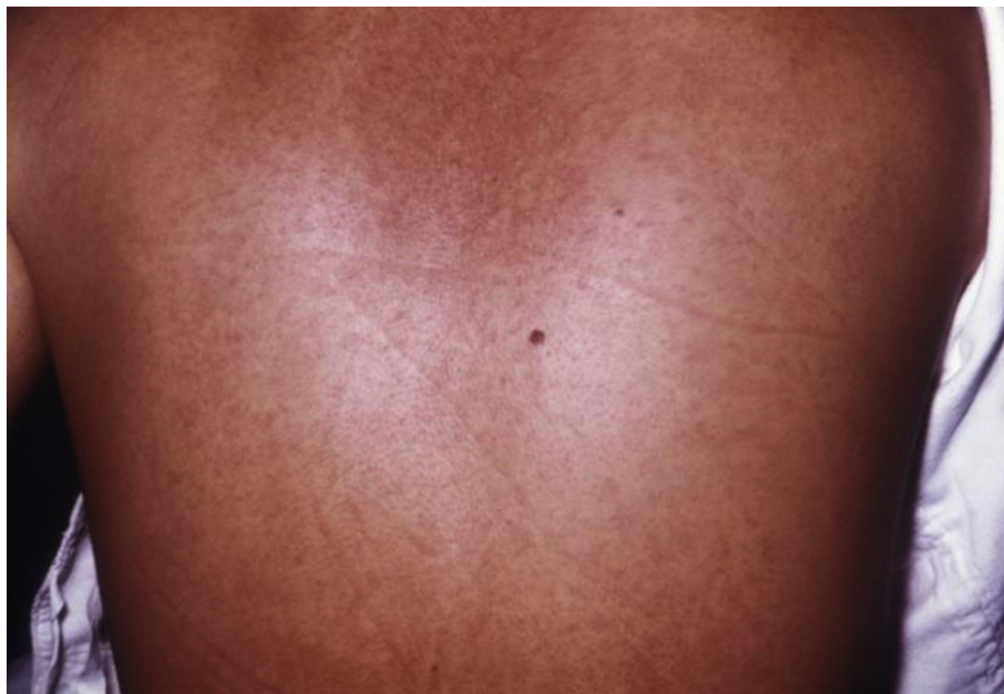
Fig. 1. Maculopapular rash.

Urticaria presents with acute, swollen, red wheals or plaques, typically associated with pruritus (Fig. 2). They occur due to a variety of causes and have been documented to occur with COVID-19. One study by Recalcati found urticaria in 3 of 88 COVID-19 patients [11]. There have been other reports of urticaria affecting various regions of the