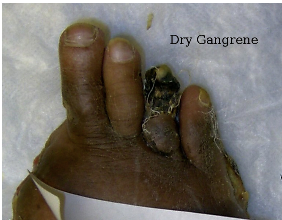
Fig. 7. Necrotic toe.

Livedo racemosa (LR) is a violaceous web or net-like patterning of the skin similar to livedo reticularis; however, this is found diffusely, compared to livedo reticularis that is found in gravity-dependent areas (Fig. 6) [39]. Reports have described LR or retiform purpura (branching grouping of purpura) in 3 patients in one series [15], as well as several other case reports [19,40]. One series of 21 cases found